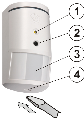
Figure: 1 – flash for illumination; 2 – camera lens; 3 – PIR detector lens; 4 – cover tab;

The detector can be installed onto a wall or in the corner of a room. There should be no obstacles which quickly change temperature (electric heaters, gas appliances, etc.) or which move (e.g. curtains hanging above a radiator) or pets in the detector's field of sight. It is not recommended to install the detector opposite to windows or floodlights or in places with over-intense air circulation (close to ventilators, heat sources, air conditioning outlets, unsealed doors, etc.). There should be no obstacles in front of the detector which might obstruct its view.